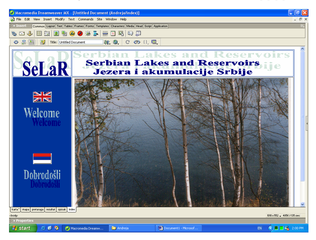
Figure 1. SeLaR Home page

Faculty of Science, University of Kragujevac develops SeLaR information system (Fig. 1) that includes all available and relevant data about lakes and reservoirs of Serbia. The information system is designed to provide users with scientific information and thus gives its contribution to adequate management of water resources and to sustainable development. In its initial phase SeLaR includes data about three larger reservoirs in Serbia - Gruza, Vlasina and Grosnica. It is available to all participants in proces of management of lakes and reservoars by Internet, and it can be found on the site of Faculty of Science in Kragujevac. These data are based on the results of researches that Faculty of Science conducted for years as well as on other available literal sources, [2], [4].