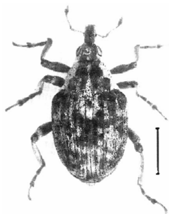
Fig. 3 – Phytobius leucogaster (from CALDARA & O'BRIEN, 1995)

host stem. The larva bites stem inside, in places making holes through a wall to the surface. Geographical distribution includes south part of Northern Europe, Central and Southern Europe and Anatolia (FREUDE et al. , 1983).