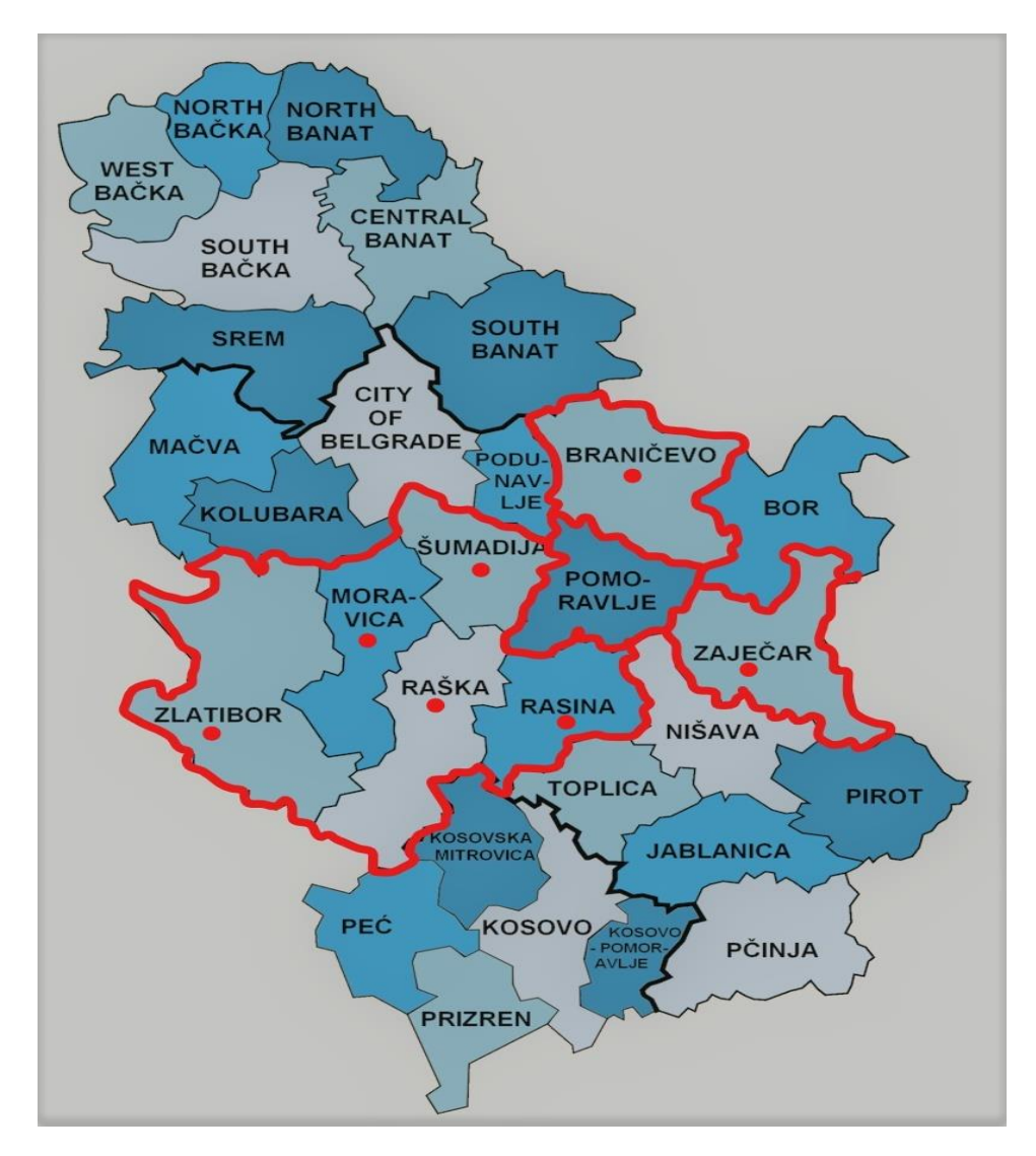
Figure 1. Map of Serbia with honey sampling regions highlighted.

A total of 135 honey samples of five different botanical origins (acacia, sunflower, linden, multifloral and honeydew) were collected from seven different regions of Serbia (Tab. 1) during 2016 harvesting season owing to The Association of the Beekeeping Organisations of Serbia (SPOS – abbreviated from serbian name Savez pčelarskih organizacija Srbije). The samples were packaged in 1 L glass containers and brought to the Veterinary Specialist Institute in Kraljevo, Serbia. The geographical origin of the samples (Tab. 1 and Supplementary Material – Tab. S1) was specified by the SPOS, based on the information provided by beekeepers. The samples were stored in the dark at room temperature until subjected to further analysis.