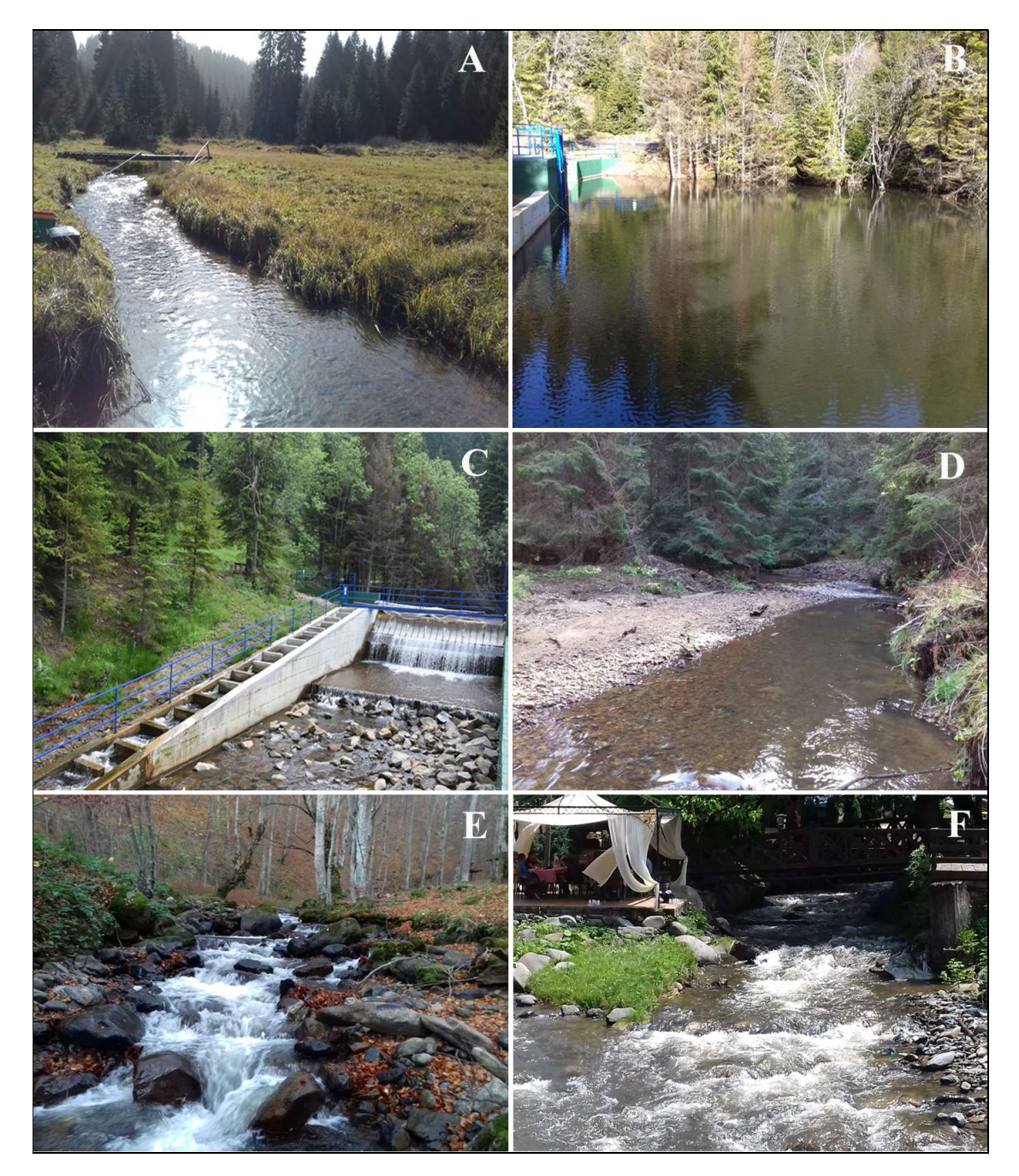
Figure 1. A – locality S1; B – locality S2; C – dam of the small HPP "Samokovska reka 1"; D – locality S3; E – locality S4; F – locality S5.

Locality S5 (Figure 1F) lies in Jošanička Spa (N 43^{\circ}23'18.3" , E 20^{\circ}45'0.42" , elevation 652 m). The Samokovska River flows through the mixed forest. There is a restaurant on the right river bank just before the mouth of the Samokovska River into the Jošanička River. Locality S5 is not within boundaries of the National Park Kopaonik (ANONYMOUS, 2016).