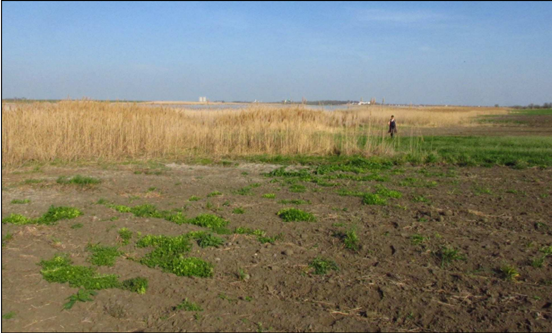
Fig. 2. Shore of Lake Rusanda, habitat of Cylindroiulus horvathi (Verhoeff, 1897) in Serbia.

mesomerite indented. Paracoxal rim prominent, embowed. Paracoxal process wide, blunt, with notches on posterior margin. Solenomerite projecting beyond tip of brachite (Fig. 3).