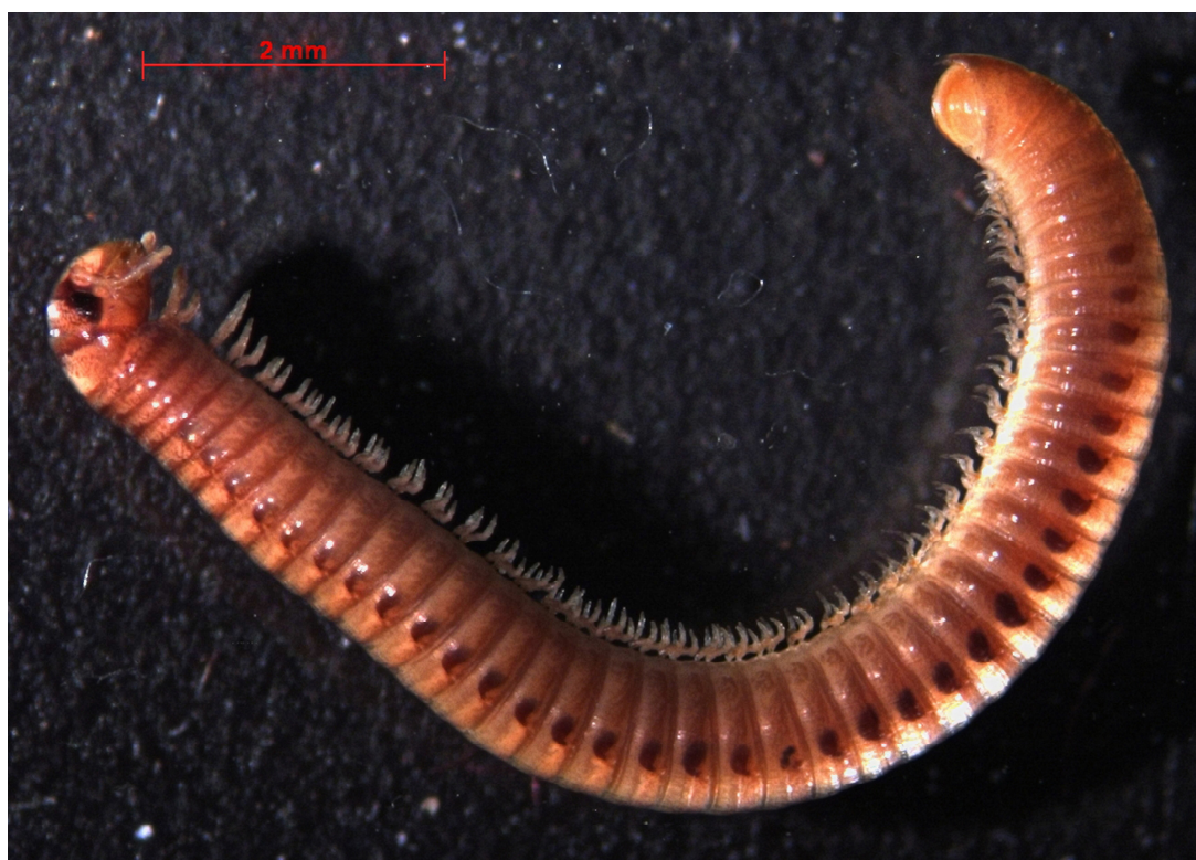
Fig. 1. Cylindroiulus horvathi (Verhoeff, 1897), a female from the shores of Lake Rusanda, Vojvodina, Serbia.

Material examined: 1 female, 1 male and a juvenile specimen from the shores of Lake Rusanda (Fig. 2), near Melenci, Vojvodina, north Serbia, collected on 3/18/2014, by M. Šćiban. Specimens are kept at the Institute of Zoology, University of Belgrade - Faculty of Biology.