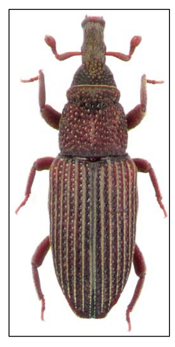
Fig. 1. – Habitus of Dryophthorus corticalis (Paykull, 1792)

Because of particular importance of swamp and freshwater habitats in Zasavica, special atention in researches was given to the registration of higro- and hidrophylious weevil species (Pešić and Stanković, 2007). But, in 2007. by Malaise trap one male specimen of D. corticalis was collected.